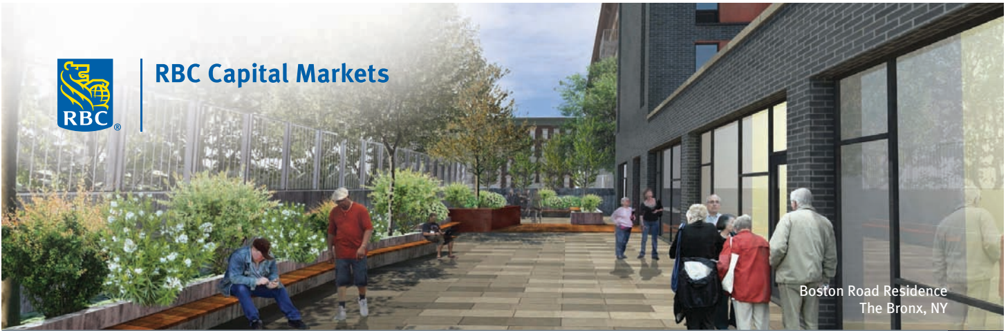
Boston Road Residence The Bronx, NY